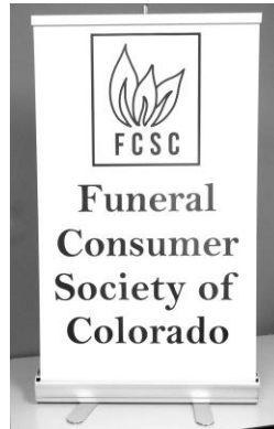
Table Top Banner